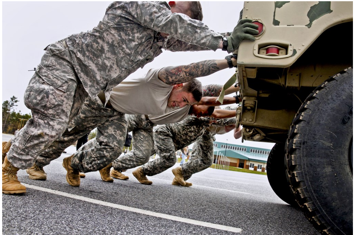
1st Infantry Division soldiers push a Humvee during the “100 yards of Hell” task at Fort Benning, 2013