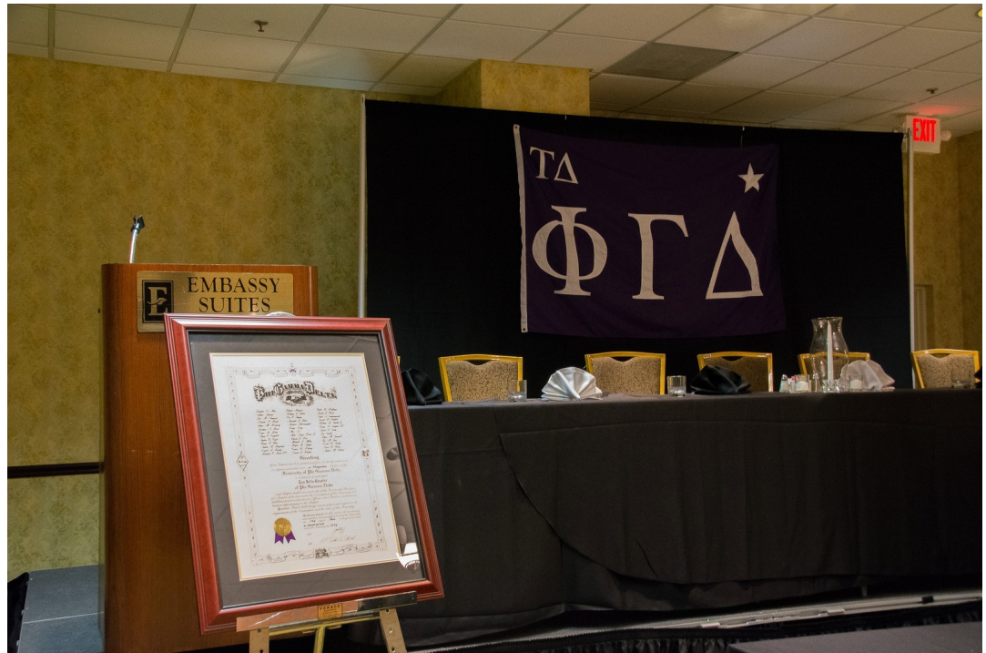
Tau Delta's 1st Annual Pig Dinner - March 22, 2014 @ Embassy Suites